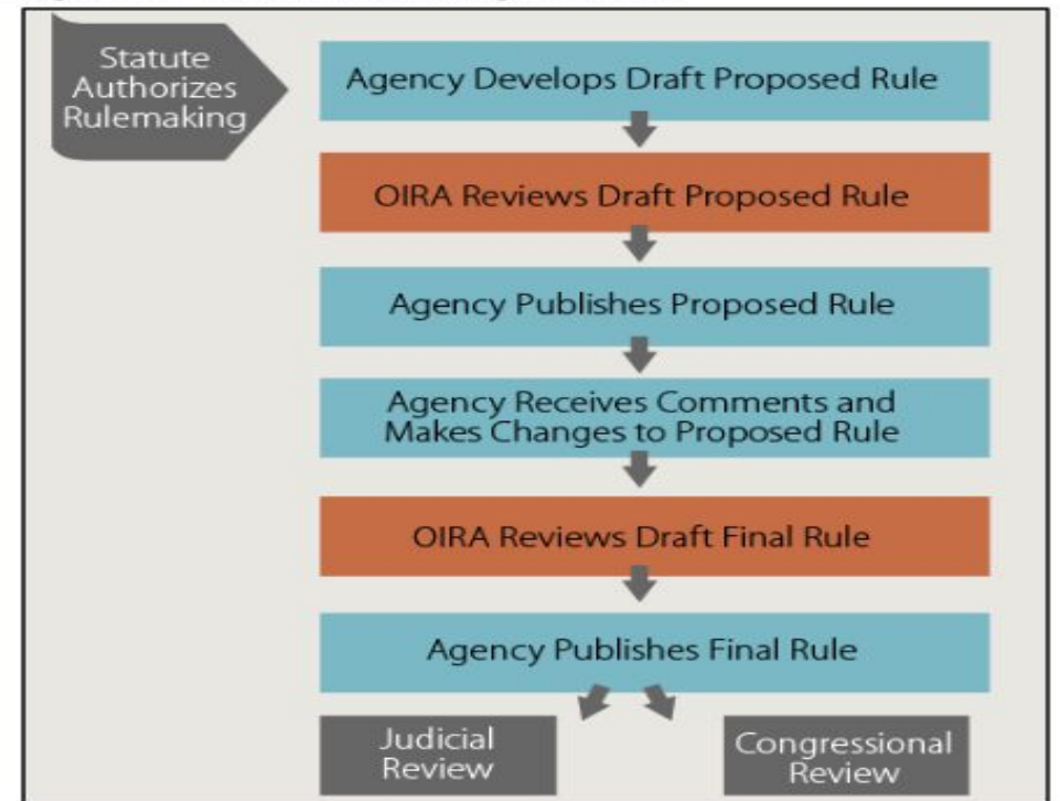
Figure 1. The Rulemaking Process